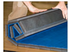
Sections should be rolled tightly for easy handling.

When rolling the mats for storage, start each roll from the same side so they match up again when unrolling. Fold over the first two flex sections to make a triangle shape, then continue rolling tightly. If the edges become uneven while rolling, they can be straightened out by lifting the roll up onto its end.