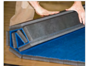
Sections should be rolled tightly for easy handling.

When rolling the mats for storage, start each roll from the same side so they match up again when unrolling. Fold over the first two flex sections to make a triangle shape, then continue rolling tightly. If the edges become uneven while rolling, they can be straightened out by lifting the roll up onto its end.